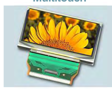
Open Frame Monitors